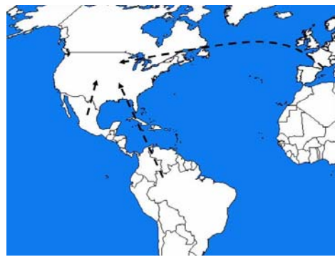
Figure 2. Main Routes of Smuggling into North America

As concerns Smuggling into North America, according to Interpol this occurs mostly by putting the migrants on planes, for instance, from Europe or more recently by South Africa. Ships with migrants are mainly bound from the west coast into the United States or Canada. Smuggling networks seem to focus more and more on Central and South America where they