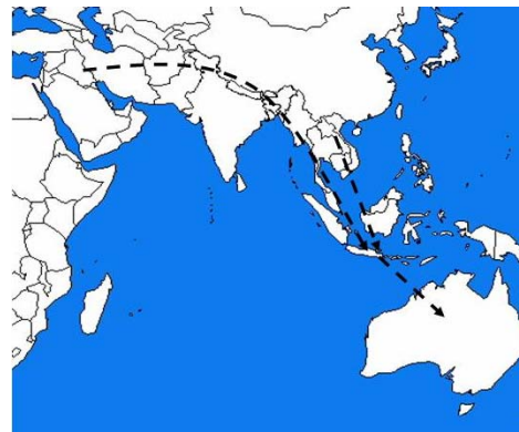
Figure 3. Main Routes of Smuggling into Australia

prevent and combat transnational organized crime. Known as the 'Palermo' convention, it has the great benefit of defining the concept of organized crime, including and overcoming what the criminologists call the Sicilian Model . The convention defines "Organized criminal group" as a structured group composed by minimum three persons, acting in concert with the aim of committing one or more